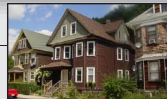
Neighborhood Ministry House