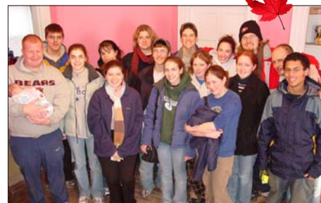
Hamilton students help paint the brand new BP house in 2003 (top). Raking at Being Thankful for My Community Day (bottom).

Happy Thanksgiving. We are so thankful for you!