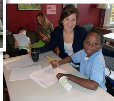
Homework Center is up and running with 15-20 students daily!