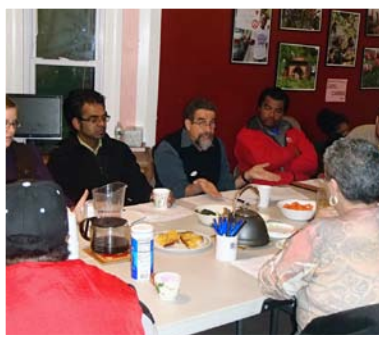
Neighbors share their ideas for affordable home ownership at a special community meeting.