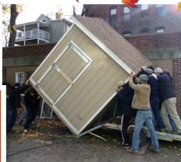
Under the direction of local landscaper Al, volunteers move the tool shed to its new location in the Community Garden.