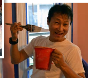
Volunteers put a fresh coat of paint on the BP living room.