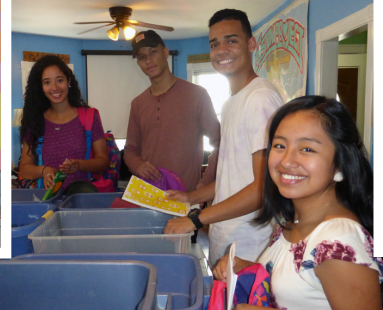
Gordon College Clarendon Scholars assemble backpacks