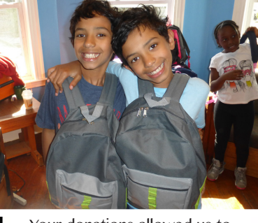
Your donations allowed us to distribute 100 backpacks to youth.

Aletheia Church plants trees with TNT neighbors on 2 Saturdays.