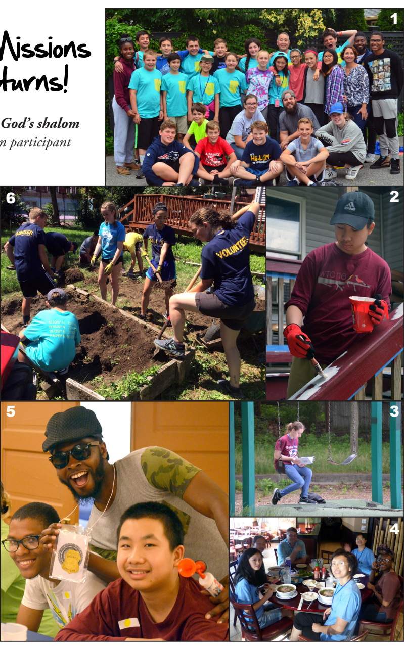
Clockwise from Top: (1) Grace Chapel Middle School Ministries; 5 New England churches joined us in 2017, (2) Painting a neighbor's porch, (3) Morning devotions at a local park, (4) Dinner at a local Vietnamese restaurant, (5) Evening simulation game called Poverty Simulation, (6) Relocating garden beds for a neighbor.

Want to impact your youth or family next summer? Join us! 2018 DATES: (1) JUNE 24-29, (2) JULY 8-13, (3) JULY 15-20, (4) JULY 29-AUGUST 3, (5) AUGUST 5-10 (FAMILY TRIP WEEK).