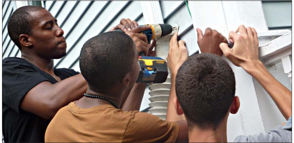
The Eco-Teens installed dozens of rain barrels for neighbors and a green bus stop roof.