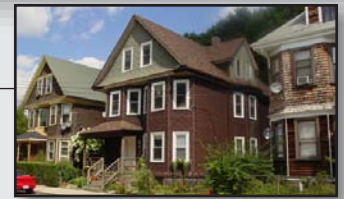
Neighborhood Ministry House