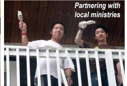
Partnering with local ministries