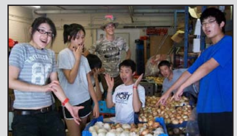
Sorting tons of fresh produce for the hungry