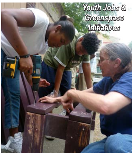
Youth Jobs & Greenspace Initiatives