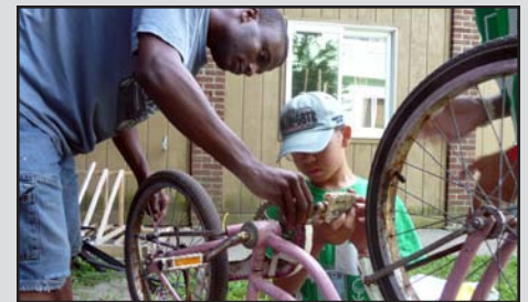
Repairing 25+ bikes for neighborhood kids