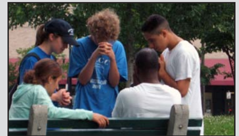
Praying over the needs of a stranger