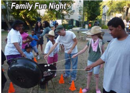
Family Fun Night