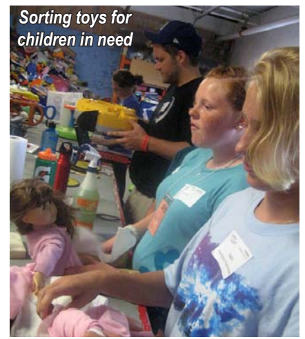
Sorting toys for children in need

At The Boston Project, we believe there are so many ways to work for justice - our God is a creative God!