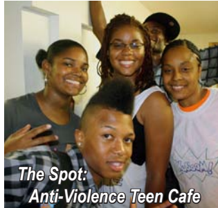
The Spot: Anti-Violence Teen Cafe