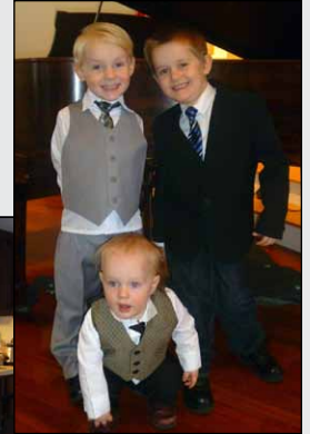
Our three sons!