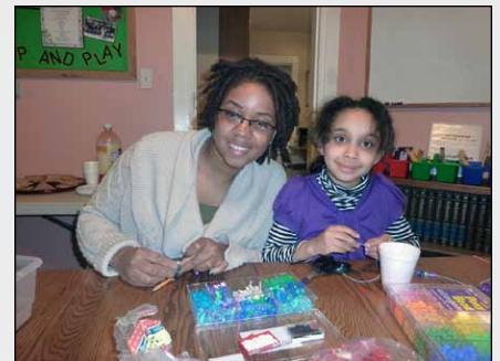
Making crafts at our new "Kid's Spot" hang-out time.