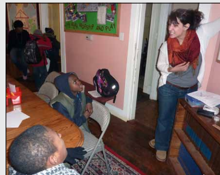
Teaching the youth how to "Just Say No!" during our H.E.A.L.T.H. program.