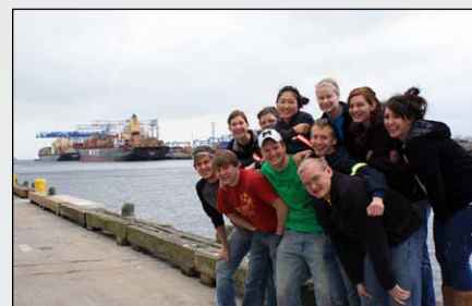
At Boston Harbor with Calvin College during their spring break mission trip with BP.