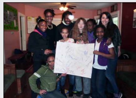
A group photo of all the girls that came out to our very first Tween Bible Study!