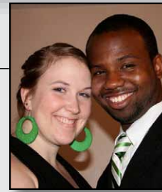
Neighborhood Youth Minister