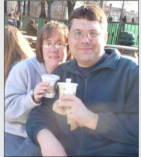
Cup of cocoa, Frog Pond, Boston Common