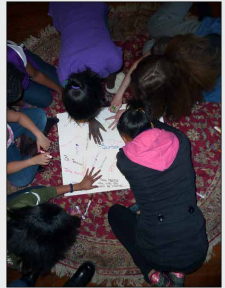
We decided to create agreed upon standards that each girl must uphold individually and as a group.