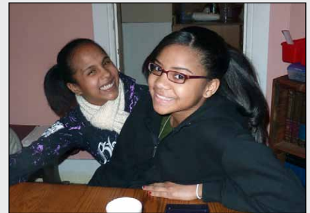
A couple of youth hanging out with us before Real Life Bible study.