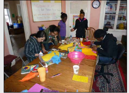
The girls having fun as we chat and design our journals.

Stay in touch nyeshia@tbpm.org 231 Fuller Street, #2 Dorchester, MA 02124