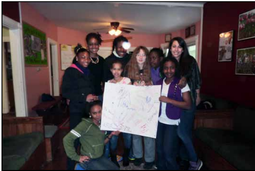
The new "Pretty Girl" Tween Bible Study