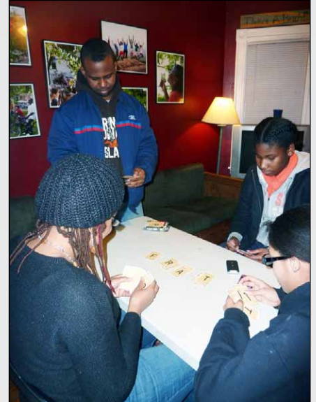
Playing games with the youth before going into the Word of God.