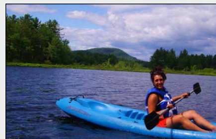
Kayaking on the lake during our staff retreat in New Hampshire.