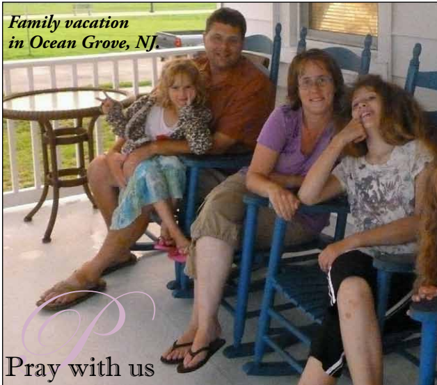
Family vacation in Ocean Grove, NJ.