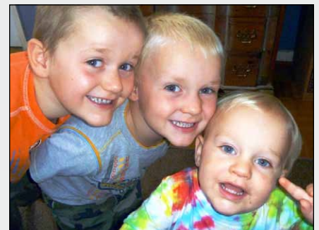
Thanks for praying for us. We love you!