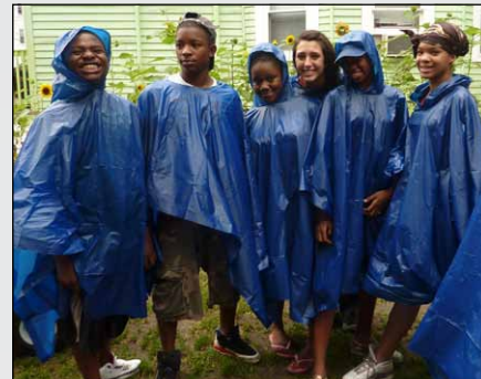
We work rain or shine! Being goofy with my Junior Park Patrol youth.