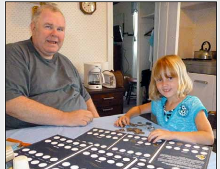
Grandpa and Grace collecting state quarters.