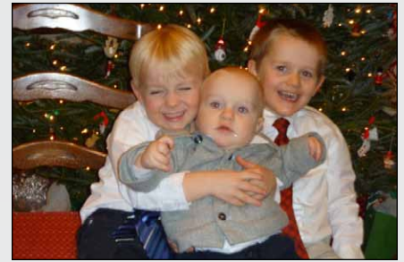
Christmas with the family