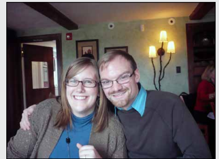
We're getting married!

Stay in touch bcressy@gmail.com 12 Elmhurst Street Dorchester, MA 02124