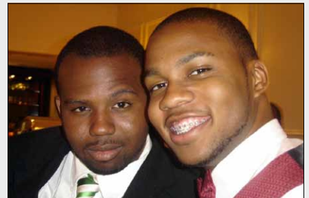
My beloved brother and I trying to be cool :)