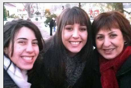
Spending time with my family on Christmas vacation