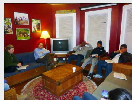
Studying the Word during Real Life Bible Study