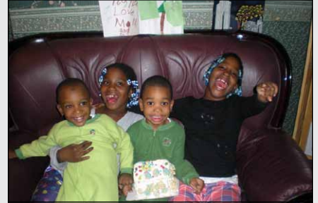
My nieces and nephews showing off their gingerbread house.