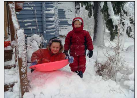
We have had enough snow this year to re-create our 40-foot snow slide!