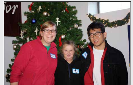
Hanging out at the Starlight Banquet for the Homeless - a large event I help plan.