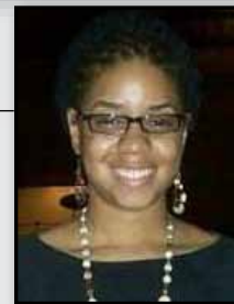
Youth Outreach Worker

Stay in touch nyeshia@tbpm.org 231 Fuller Street, #2 Dorchester, MA 02124