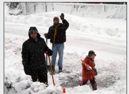
Shoveling out some of the properties we manage. It never stops snowing.