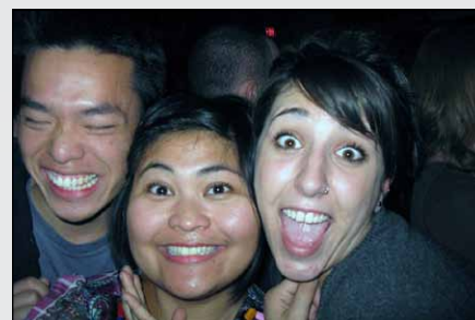
My friends from AmeriCorps and I sharing a few laughs on our weekend off.