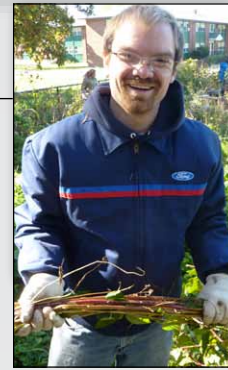
Green Space Coordinator