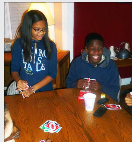
Playing Uno with the teens during Real Life Bible Study