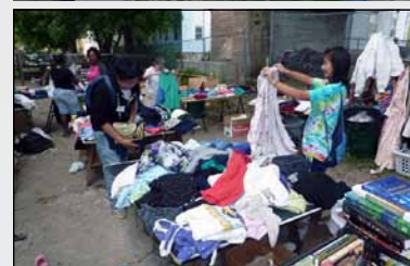
Fall Service Day with Park Street Church