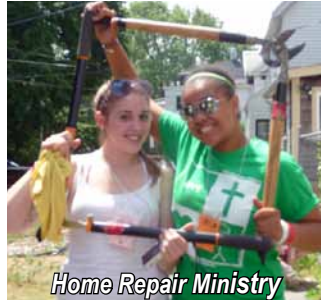
Home Repair Ministry