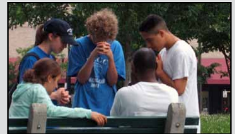
Praying over the needs of a stranger