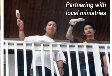
Partnering with local ministries