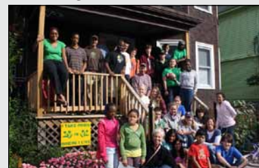
Columbus Day Service Day with Neighbors and St. John's Church