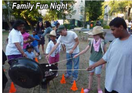
Family Fun Night