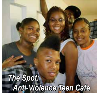
The Spot: Anti-Violence Teen Cafe