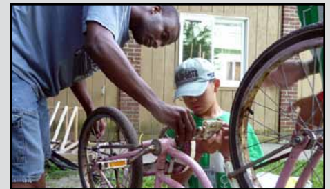
Repairing 25+ bikes for neighborhood kids