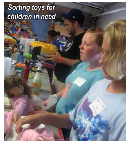
Sorting toys for children in need

At The Boston Project, we believe there are so many ways to work for justice - our God is a creative God!