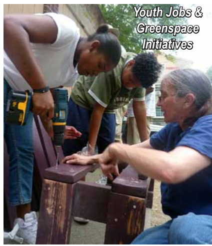
Youth Jobs & Greenspace Initiatives