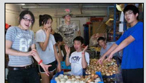
Sorting tons of fresh produce for the hungry